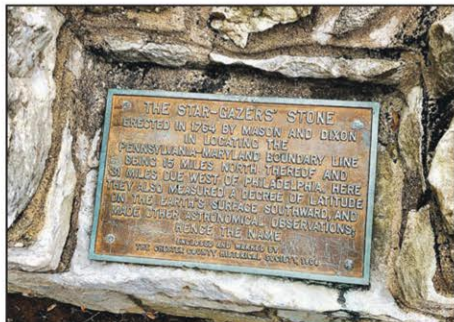
Plaque on the Stargazer's Stone near Embreeville.