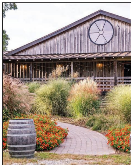
Galer Estate Winery in Kennett Square