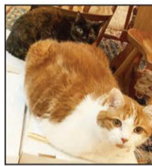
Chaddsford Winery cats Sawyer and Bailey, courtesy of Chaddsford Winery.