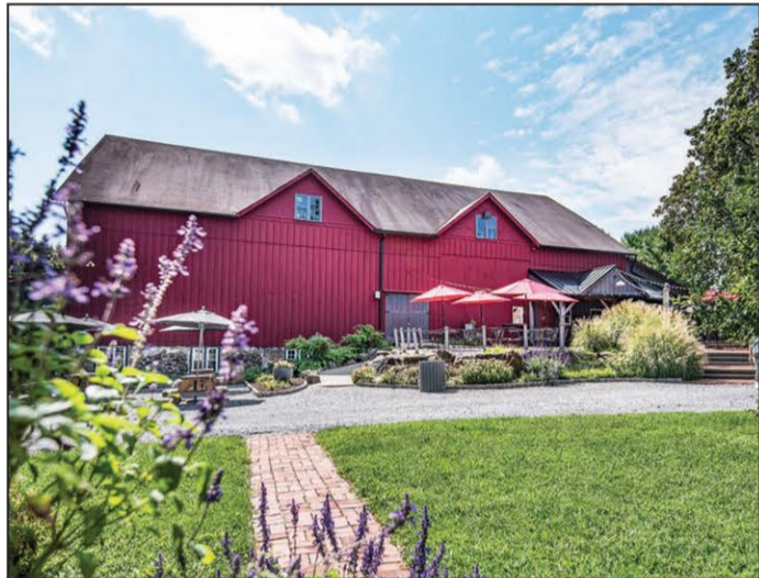
Chaddsford Winery in Chadds Ford