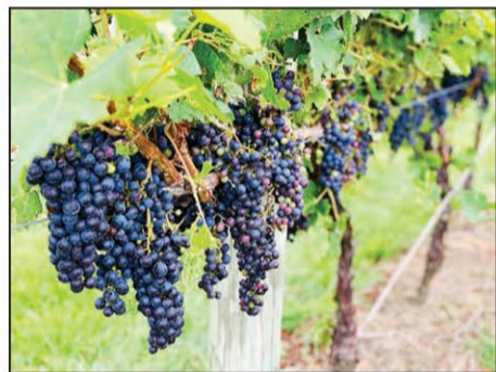
The 1723 Vineyards in Landenberg, courtesy of 1723 Vineyards.